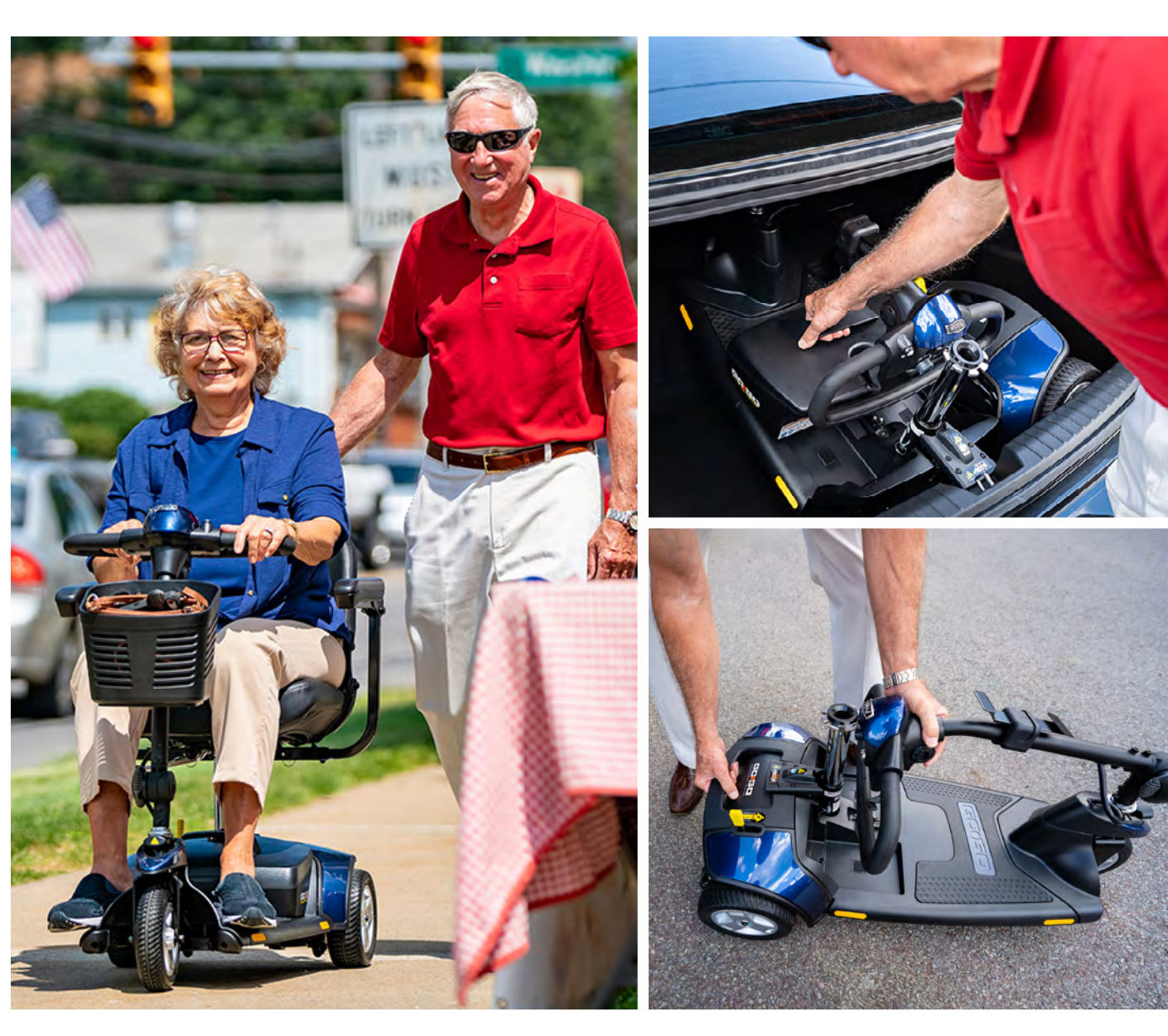
FDA Class II Medical Device