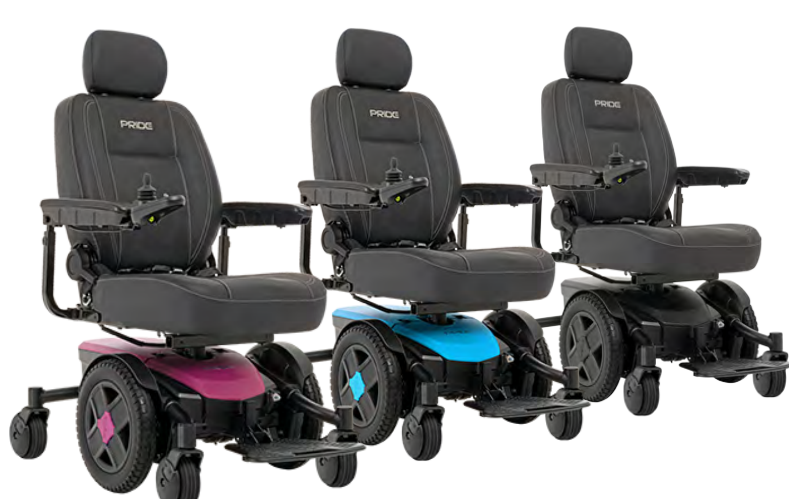
FDA Class II Medical Device